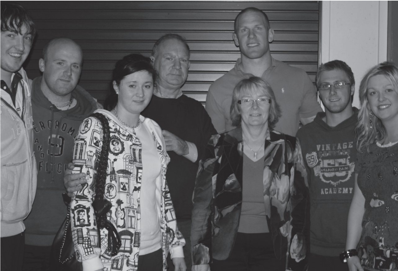
Munster, Ireland and Lions player

Further donations can be made to the charity through the AIB. The Account number is 2338808 and the Sort Code is 93-23-96