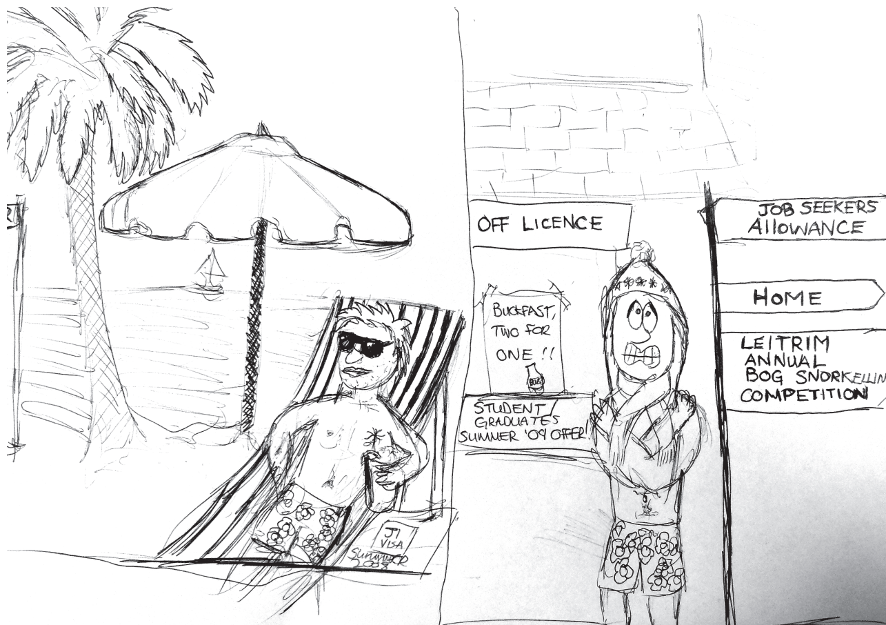
As the distant memories of gluttony and basking in riches fade away, the prospects of summer '09 in Ireland loom on the horizon.