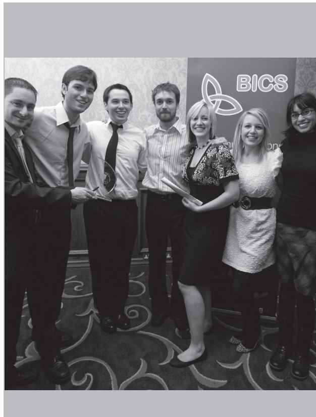
Members of UL International Society receive their award for Best Society of the Year at the national BICS ceremony held in Athlone on 14 and 15 April

They will be in the Students' Union from 2 June and will be contactable at firstname.surname@ul.ie .