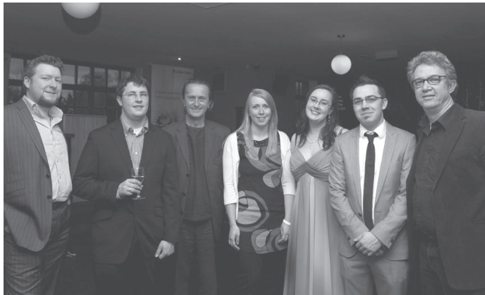
ISDA Opening Ceromony.