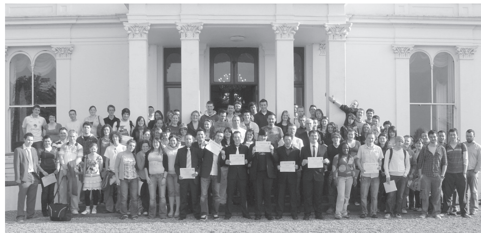
Class reps with their certs outside Plassey House.